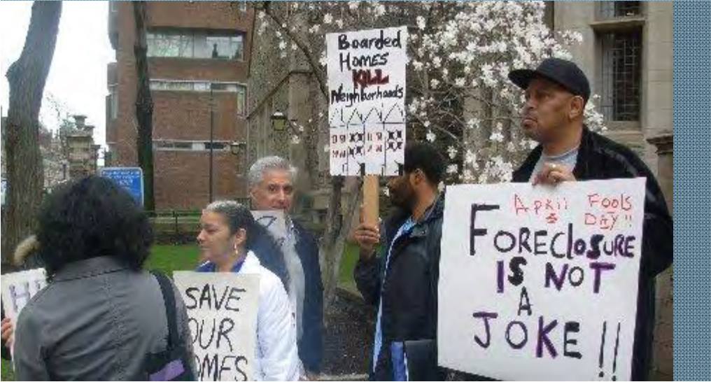
PUP members protesting outside a Hope Now Alliance counseling session in April 2008.

“Foreclosures undercut housing costs and pull down neighboring property values. Until these mortgages can perform and make the securities that they underlie have some value, we are not going to resolve the financial crisis in this country.”